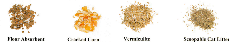
Different types of filler material that can be mixed with prairie seed to increase its bulk and improve flow through a grass drill.