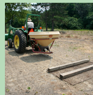
Broadcast seeding with a Viacon fertilizer spreader and dragging a piece of fencing to incorporate the seed into the soil.

To assure that the seed is evenly distributed and dispersed over the planting site the seed must be properly mixed and the seeding rate carefully calculated. The seed should be mixed in equal parts with inert material such as vermiculite, cracked corn or kitty litter. This will increase the volume of the seed. Because of improvements in seed cleaning, the volume of prairie seed needed to plant a smaller site (1 acre or less) may not fill a 5-gallon bucket. Mixing any of these materials with the prairie seed will improve the seed flow through the seeder, and will make calculating the seeding rate much easier. Seed can be mixed in a plastic tub by hand or on a concrete slab using a flat shovel. If you use a mechanical seeder, calibrate the equipment before sowing seed and follow the calibration procedure as listed in the owner's manual. If seed is hand broadcasted, divide seed by half and sow each half over the entire site so the site is seeded twice. This will ensure even seed dispersal and distribution over the site. After seeding, seed should be incorporated into the soil to improve seed-to-soil contact. Incorporating seed into the soil can be done by dragging a piece of heavy chain, or a piece of chain link fencing, or using a drag harrow, or raking seed in with a garden rake. Drag, harrow, or rake until the seed disappears. Finally, pack the soil with a cultipacker or lawn roller.