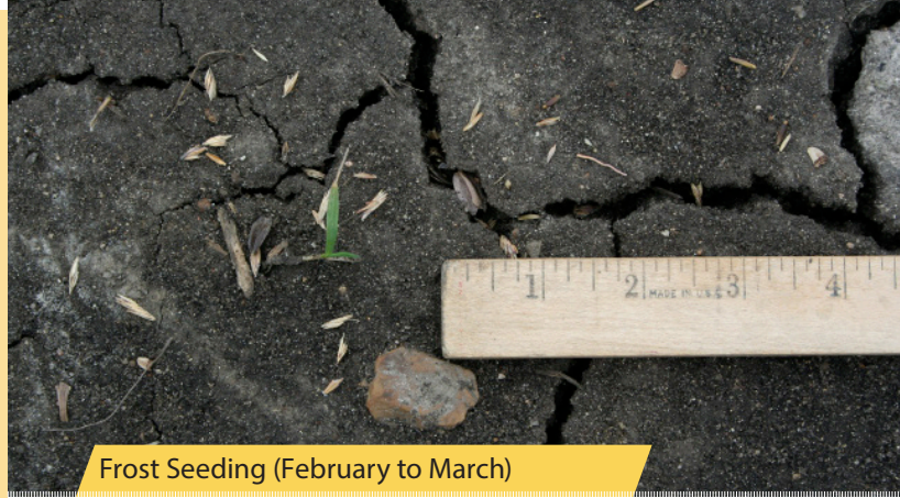
Frost Seeding (February to March)

Planting mid and late-summer is risky business. New germinates exposed to excessive heat and drought will perish. In addition, many prairie species require 2–6 weeks to germinate. By the end of the growing season, it is likely that seedlings may be too small to survive the winter. Seeding natives during this time is not recommended.