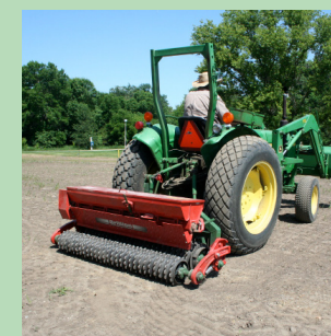
Seeding natives with a Brillion grass seeder. Seed is dropped in between two steel wheel gangs-one conditions the soil and the other cultipacks the seed.